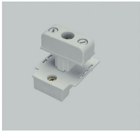
01 303 holder for flexible copper